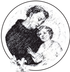
St. Anthony's Prayer Cell