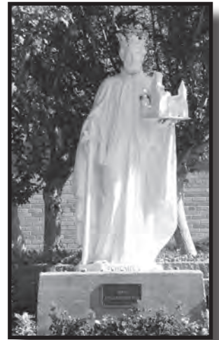
St. Henry's on Paulding & Hessen Cassel

humbling prayer requests to anyone who is there. Our goal is to fill the church with anyone who is willing to help us pray for those who need it most. Everyone is welcome so please come by. Additionally, we are emailing the requests to our board members who are praying for the requests throughout the week. Won't it be amazing to see the miracles performed through our prayers? We are quickly realizing that this is our most important and enjoyable ministry.